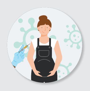
Thousands of pregnant and breastfeeding women have received these vaccines already and they have been found to be safe for both the mother and baby.