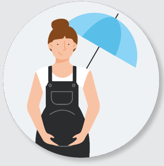
that babies can get some level of protection when their mother is vaccinated.