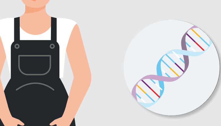
It is biologically impossible for messenger RNA (mRNA) to change you or your baby's DNA.